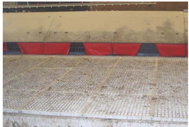
Premium+ duck nest with slats